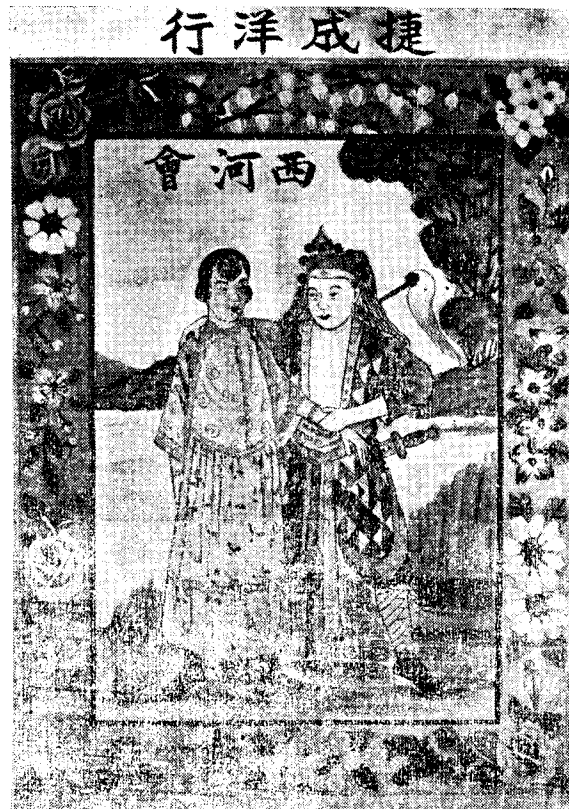
JEBSEN & CO.

N OTICE is hereby given that Jebson and Company, of Victoria, in the Colony of Hongkong have on the 1st day of May, 1926, applied for the Registration in Hongkong in the Register of Trade Marks, of the following Trade Mark :—